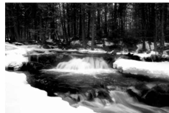
Orra Phelps Preserve is beautiful during all four seasons.

Description: The Orra Phelps Preserve boasts several marked trails and multiple boardwalks winding along the Little Snook Kill. The property contains wetlands, wet woodlands, and an upland area with sandy soils boasting fringed gentian and horsetail. It also contains many types of loam, including Charlton, Hinckley Gravelly Sand, and Sutton Loam. Dr. Orra Phelps planted many native floral species here, and it is rumored that 75% of New York's indigenous fern species are growing here.