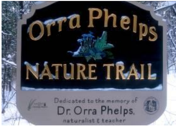
This sign welcomes visitors to the Preserve's nature trail.